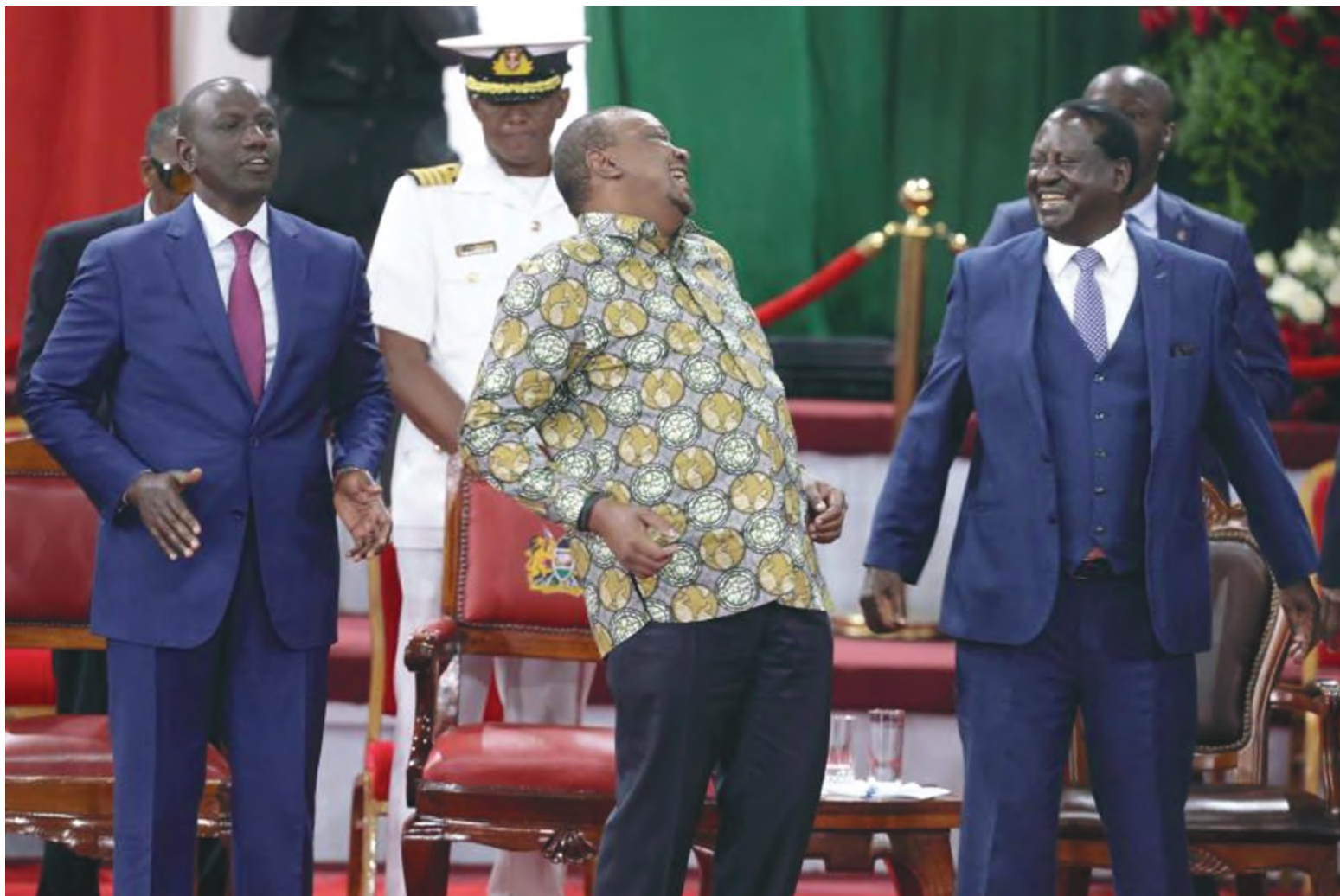
Deputy President William Ruto, President Uhuru Kenya and ODM leader Raila Odinga at Bomas

Political state of the nation is taking a new twist by day despite the election being two years down the line. It has been barely three years since the last general election was held with the formerly two best of buddies going fondly by the name UhuRuto sailing through in 2017 easily.