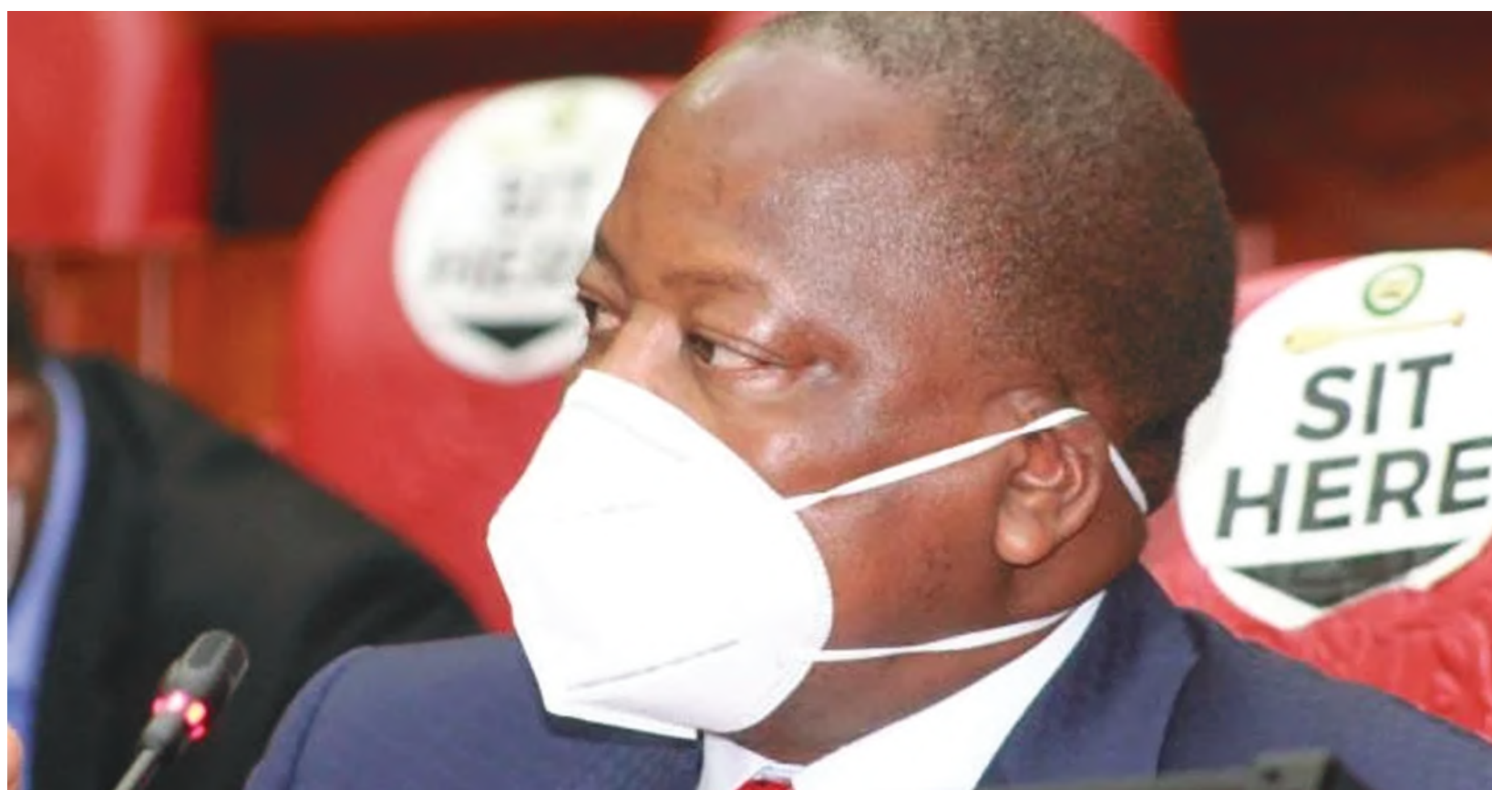
Health CS Mutahi Kagwe when he appeared before the National Assembly Health Committee.

Mutahi Kagwe the Cabinet Secretary for Health is a man under constance pressure to step aside pending investigations of alleged loss of billions at the Kenya Medical Supplies (KEMSA) which were meant for Covid-19 mitigation measures.