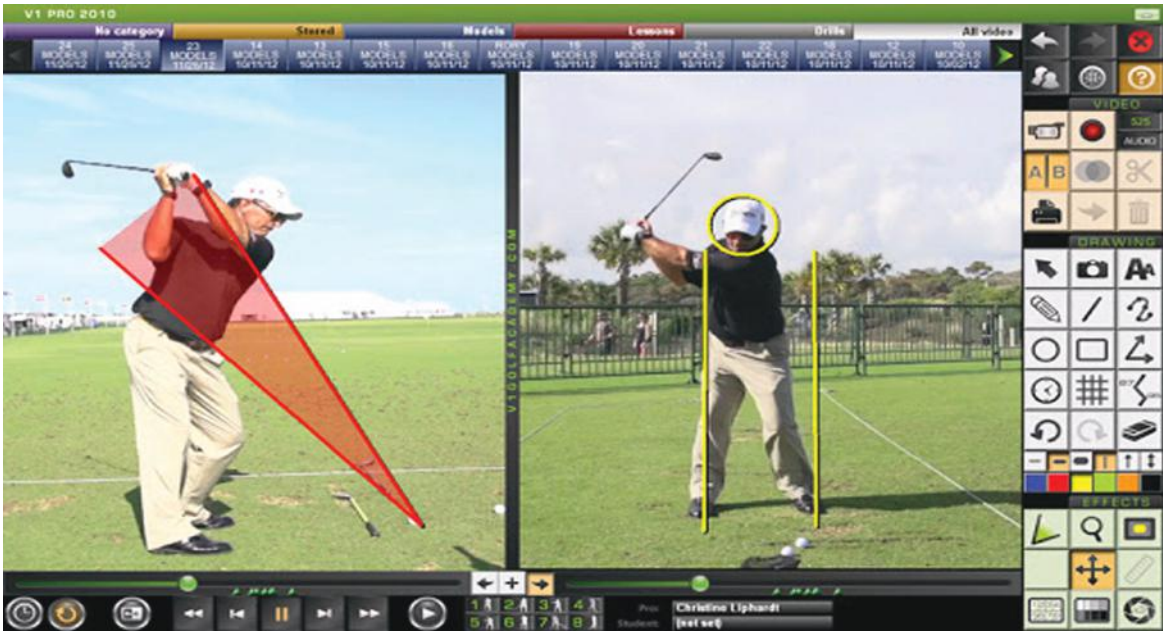
V1 Golf - Swing Analysis & Coaching