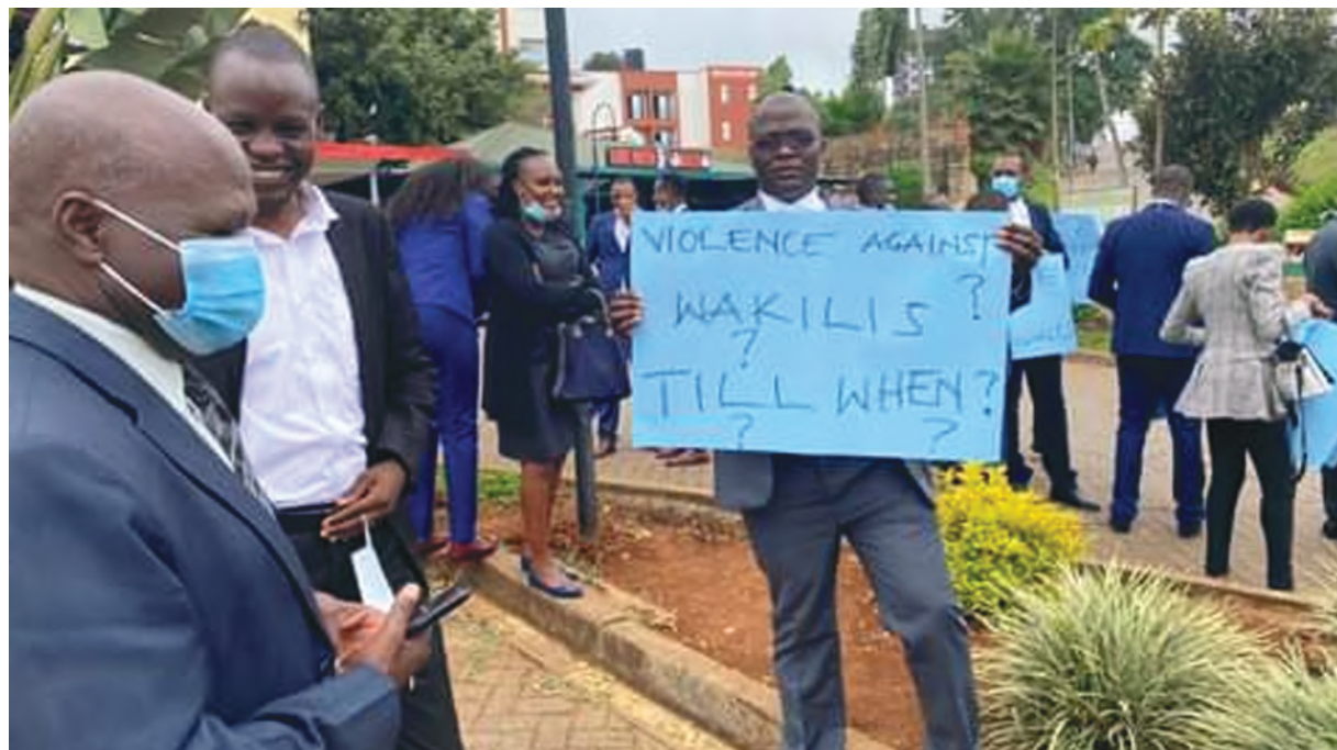
Lawyers Protest at Meru town next to Sayen Supermarket over the Shooting of a Colleague at Maua town on Thursday. The angry lawyer later headed to Maua where they demonstrated the shooting of their colleague.