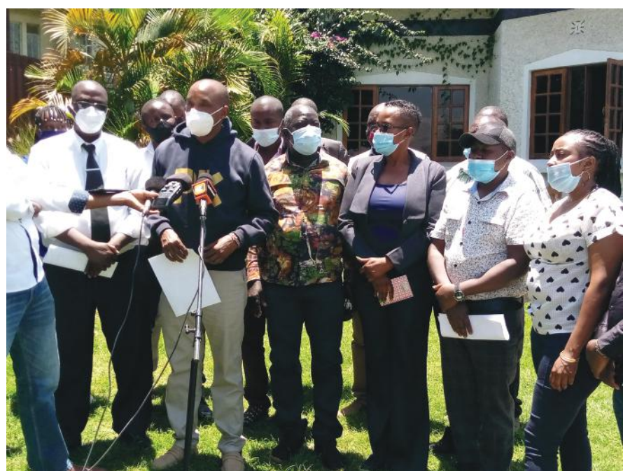
A section of Nakuru Political aspirants during the launch of the National Aspirants Forum (NAF) chapter in Nakuru.

NAF, which brings together aspirants for all elective positions from diverse political parties will be tasked with the responsibility of securing the interests of aspirants who will be facing it out with the incumbents during the 2022 general elections.