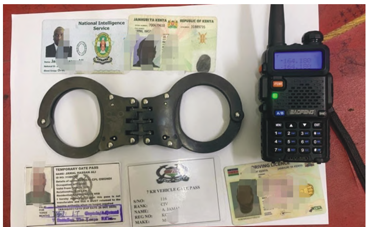
5 conmen impersonating NIS and military officers arrested.

quarters are said to have liased with their officers at the Parliament Police Station, who pounced on the two suspects as they discussed with