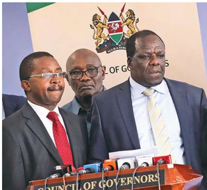
Members of the Council of Governors led by their Chairman Wycliffe Oparanya (C), Vice Chairman Mwangi wa Iria (L) and Kivutha Kibwana (R) during a past press briefing.

The governors urged the National treasury to urgently release half of the County equitable share of rev-