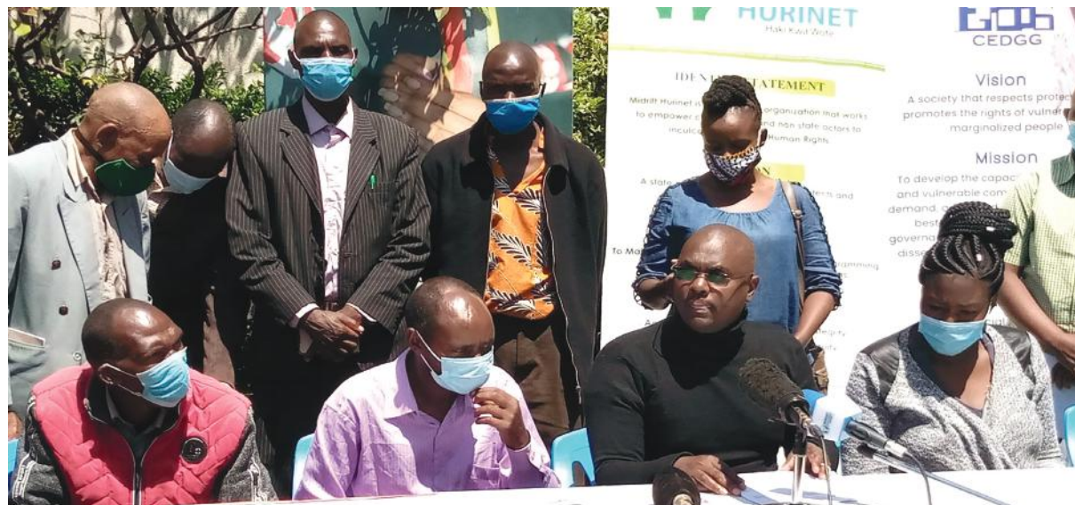
Nakuru Human rights defenders and community members from warring communities when they addressed the media in Nakuru.

To further restore peace and trust among the communities, the civil