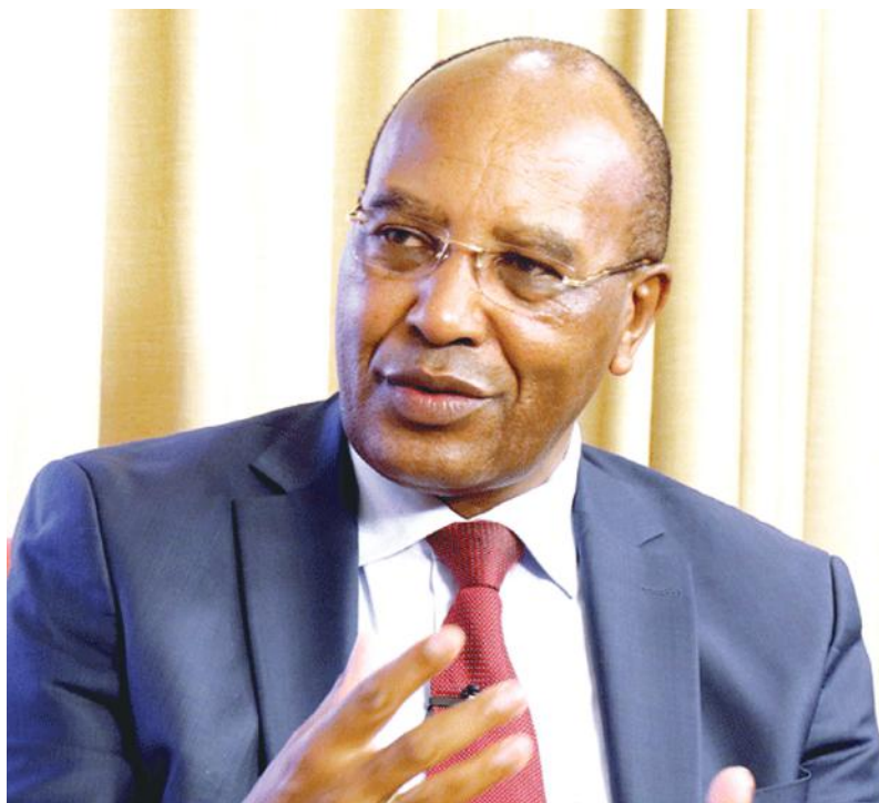
Governor Kimemia reshuffles Cabinet but did not fire any members

It was carried out in conjunction with doctors from the AIC-CURE