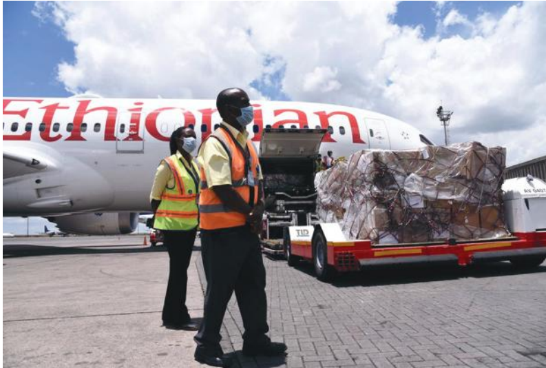
Transport Ministry confirms some Jack Ma Covid donations are missing

“What we were supposed to receive were 697 packages, but when that consignment arrived in the country it had 21 packages less... the 21 packages never arrived in Kenya so that shortfall