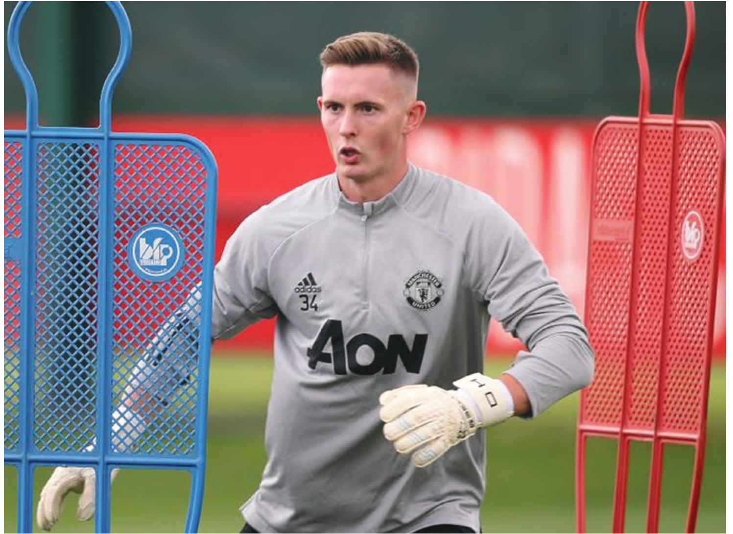
Dean Henderson

Dean Henderson has set his sights on dislodging David de Gea as Manchester United's first-choice goalkeeper and becoming England's No 1 this season.