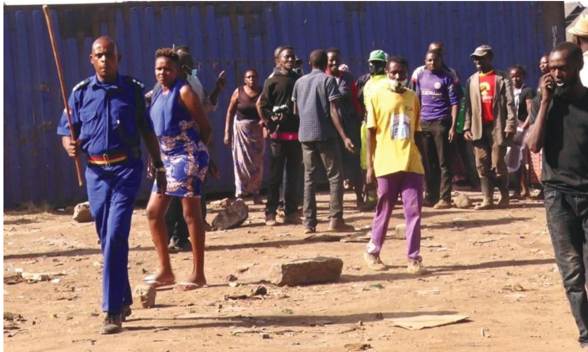
Jua Kali artisans in Gatuanyaga area in Thika West Sub County protested over a scheme by a prominent businessman to grab public land.

through local administration, they will establish who sold the land and ensure action is taken against them. "He has been instructed to stop further development of the land until he provides documentations to prove ownership. Again, we shall hunt down those who sold the land