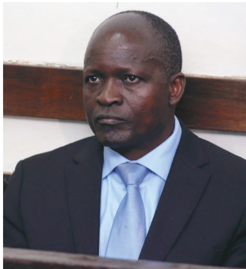
Migori Governor Okoth Obado.

The Governor and co accused were also ordered to surrender their passports to the court, not travel outside the country and not interfere with witnesses.