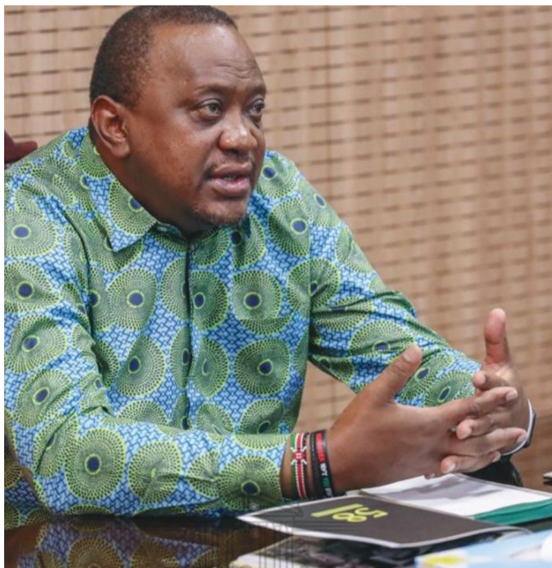
form will increase accountability and trust within government insti-