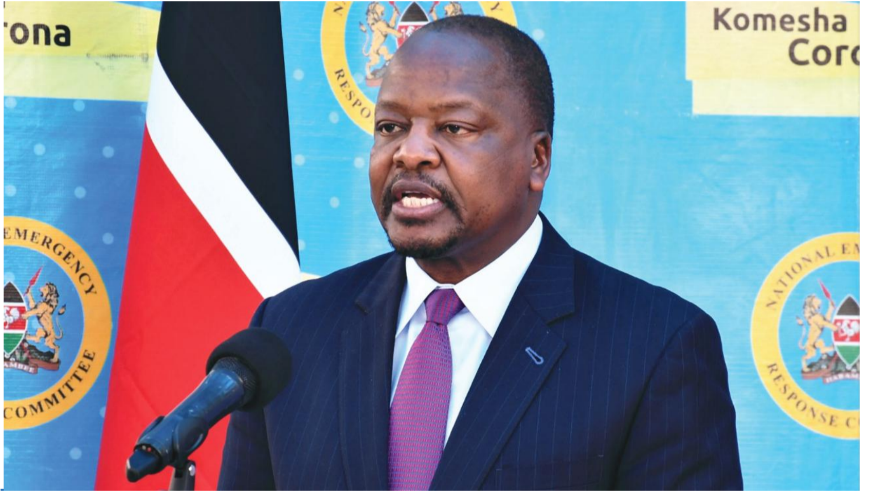
Health CS, Mutahi Kagwe

P. 14. All importers and exporters of alcoholic beverages in the country must obtain a licence from the regulatory agency