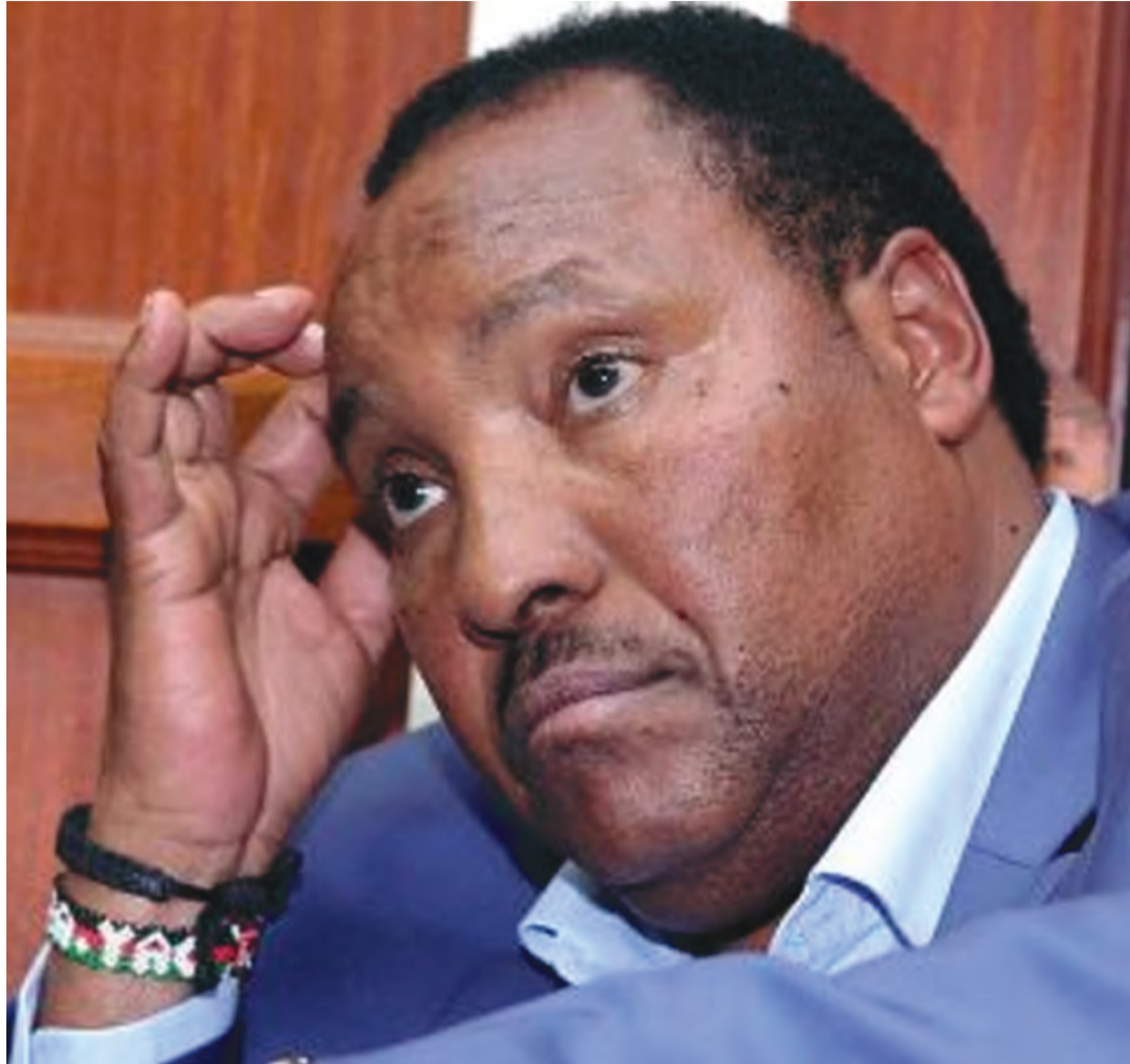
immediate former Kiambu governor Ferdinand Waititu.

Those who feel like they own the nation or feel like entitled in the society do less to preserve the rights of every citizen and other