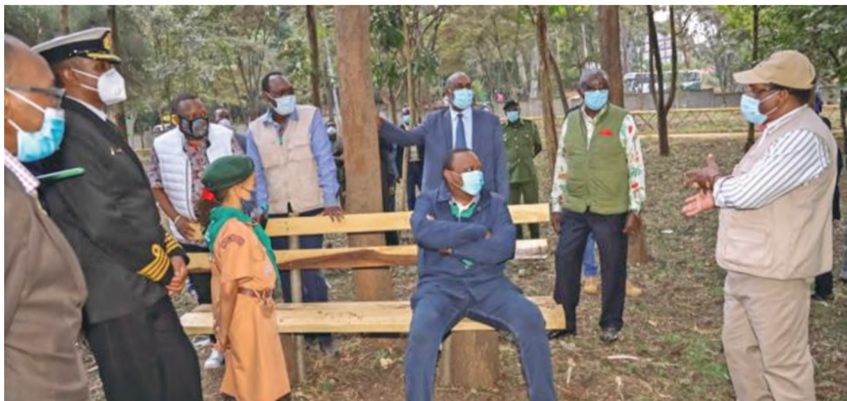
President Kenyatta and Environment Cabinet Secretary Keriako Tobiko during the launch of Michuki Park in Nairobi on August 14, 2020.

the place where the national question of Kenya’s independence was posed and debated by Africans.