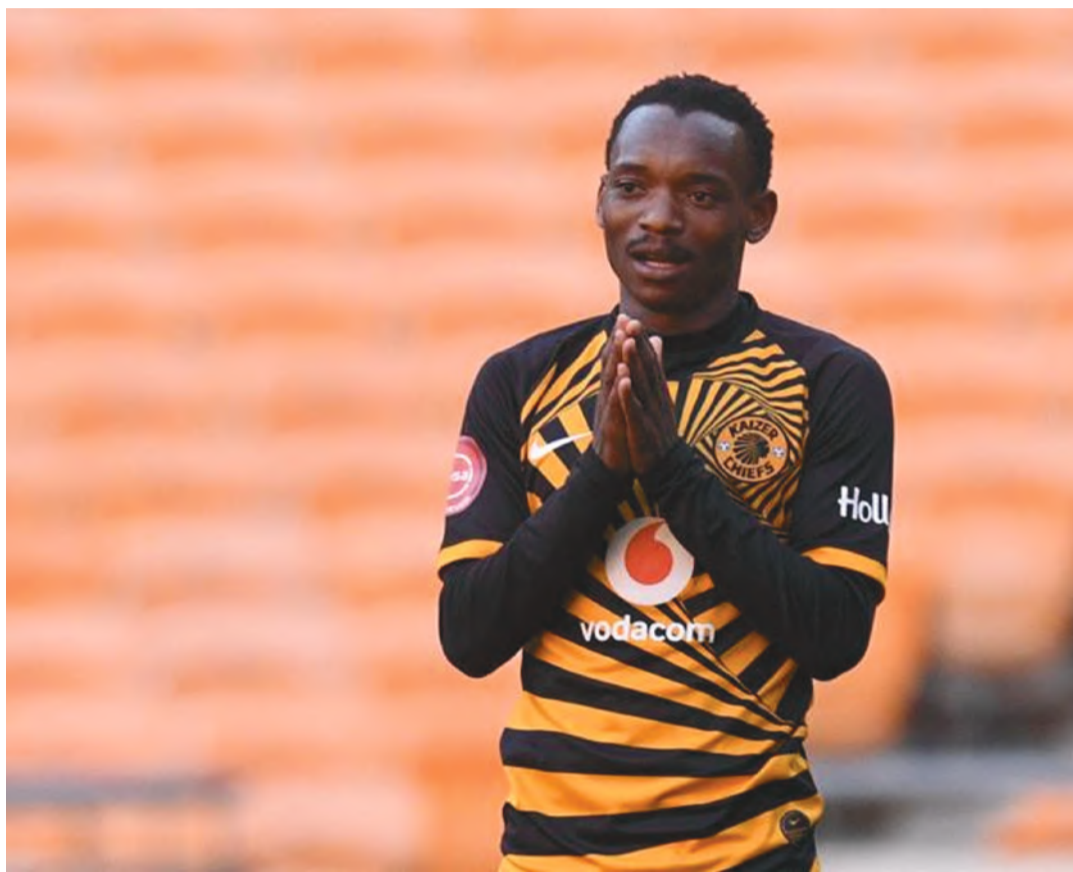
Khama Billiat

Kaizer Chiefs will be out to keep themselves in Absa Premiership title contention when they host Chippa United at Orlando Stadium on Wednesday, 2 September. Kick-off is at 18:00 CAT.