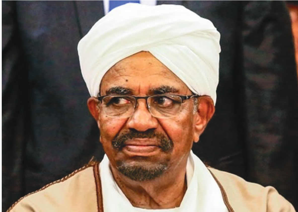
Omar al-Bashir took power in a 1989 coup and was toppled by the military in 2019