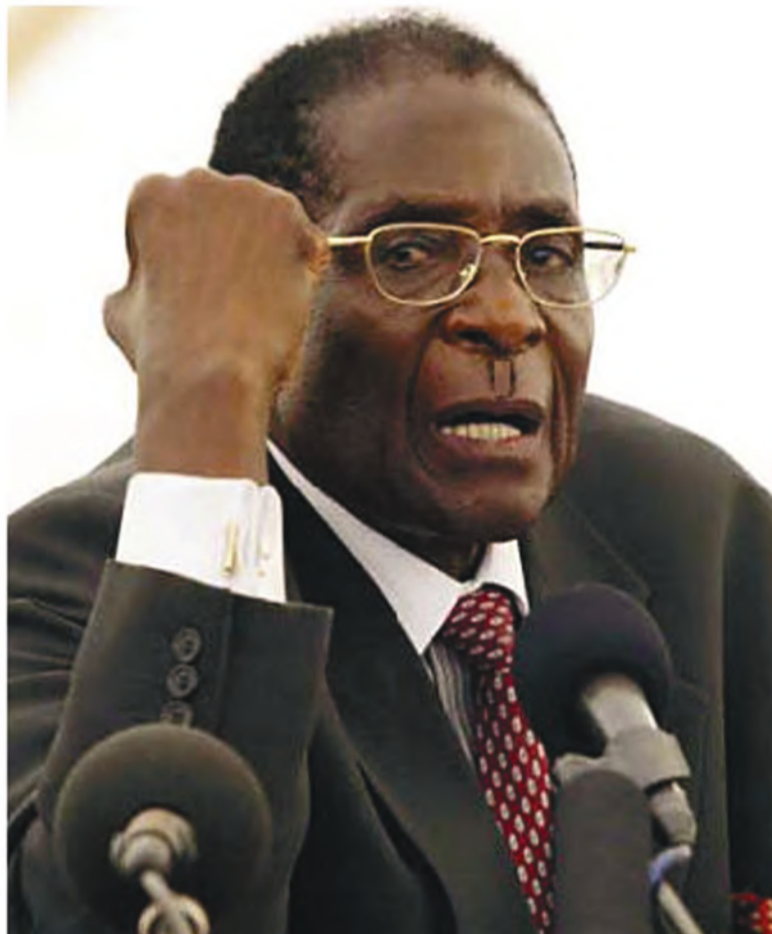
Former Zimbabwe President Robert Mugabe

The just-completed power transition in Mali marked the third time in as many years for a coup d'état in the continent. It is the second one in the eight years for the country. The toppled leader, Ibrahim Boubacar Keita, came at heels of yet another coup.