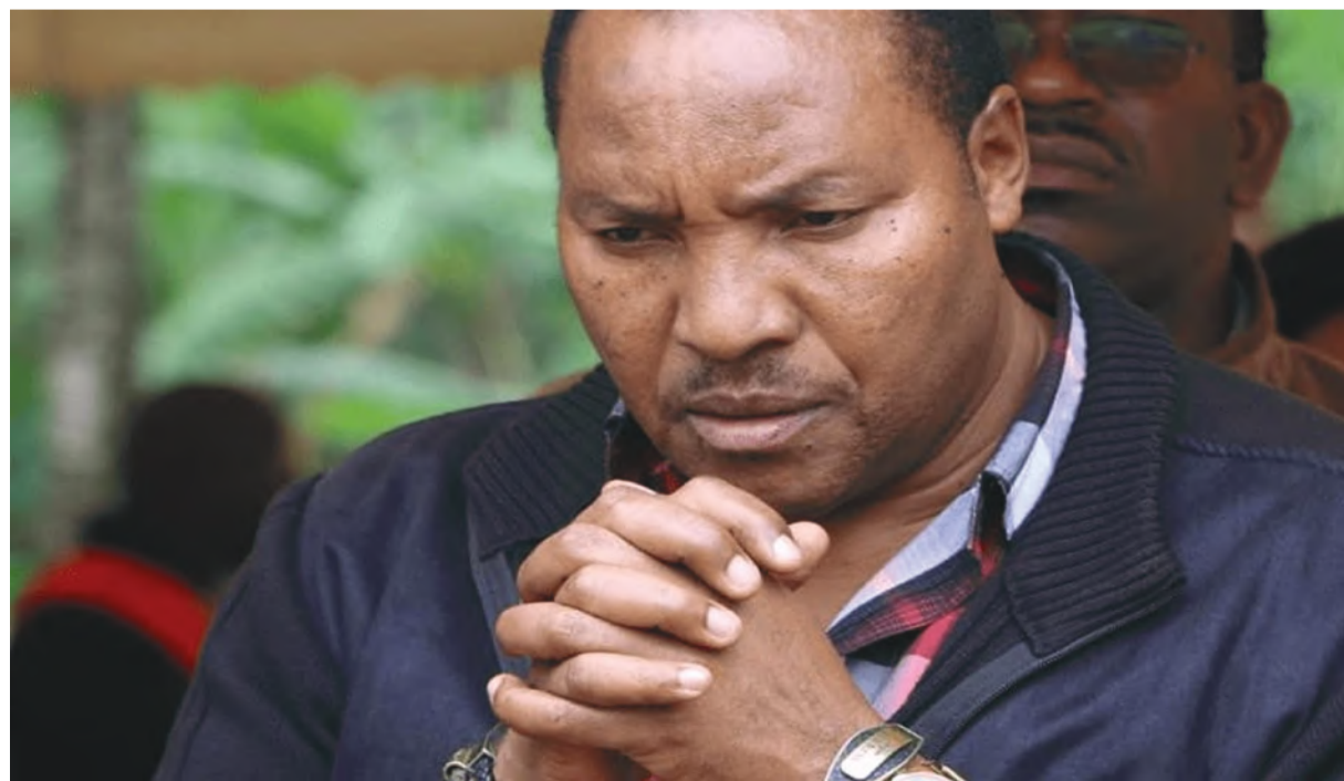
Former Kiambu Governor Ferdinand Waititu

Twenty-eight senators supported the charge on crimes under national