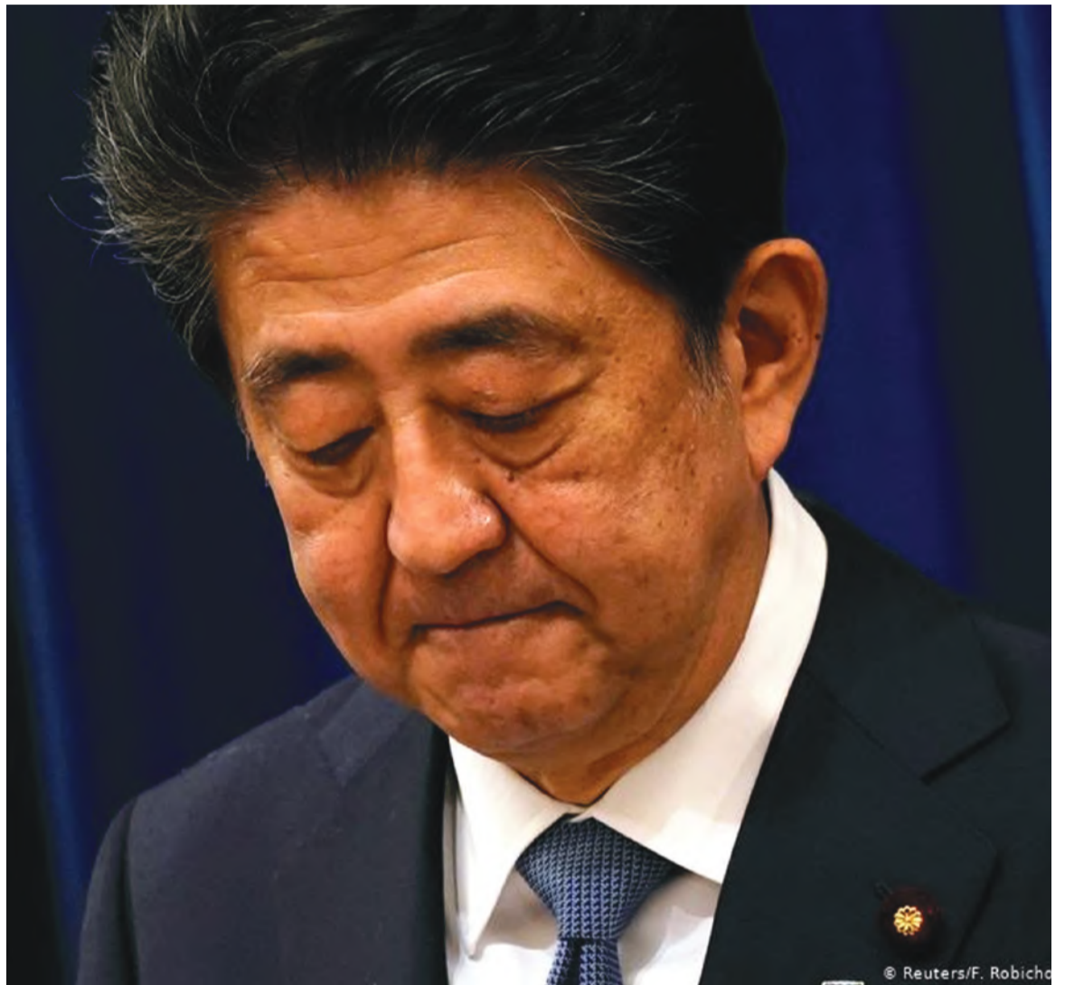
Japanese Prime Minister Shinzo Abe

Experts said the election process was likely to happen in coming