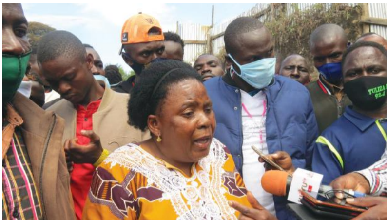
Photo Caption: Family of a deceased man address media outside Meru Level Five Teaching and Referral hospital Mortuary after they were denied permit to pick body of their beloved one.

According to the family the hospital Matron informed them on Wednesday last week that Gitonga who had been admitted in the hos-