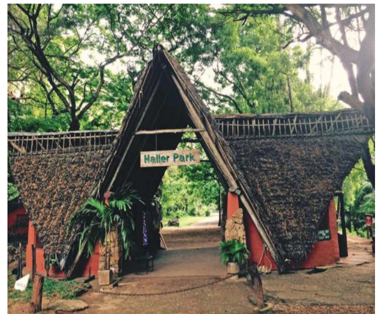
Haller Park Mombasa