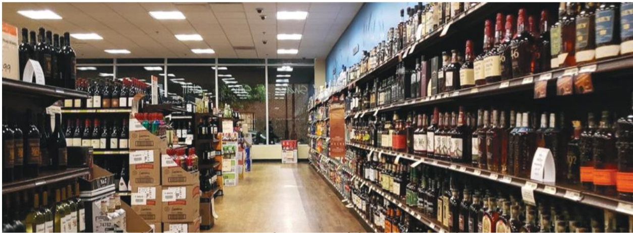
Nacada to Okay importation and exportation of alcoholic beverages